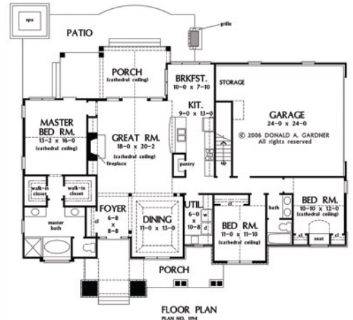
FLOOR PLAN PLAN NO. 1094