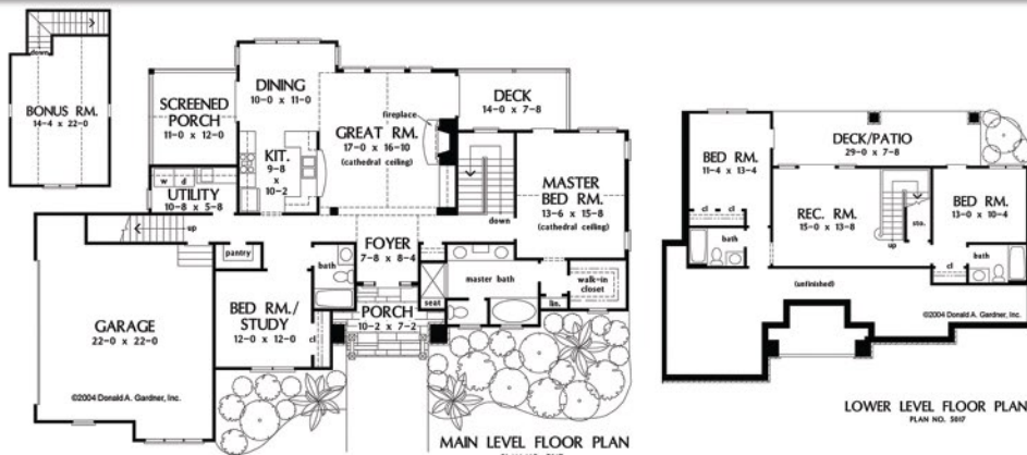
LOWER LEVEL FLOOR PLAN PLAN NO. 1017