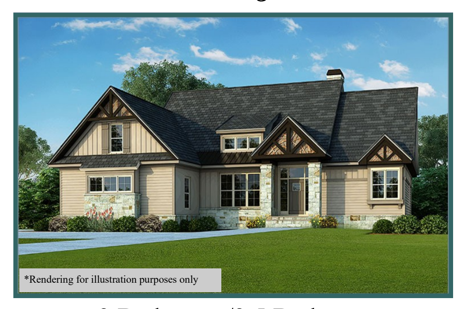
3 Bedrooms/2.5 Baths Over 2,400 sf with FINISHED Bonus Room Located on Premier Vista Lot 260 OFFERED AT $439,600

Is Proud to offer our 2017 Home "Value with Elegance"